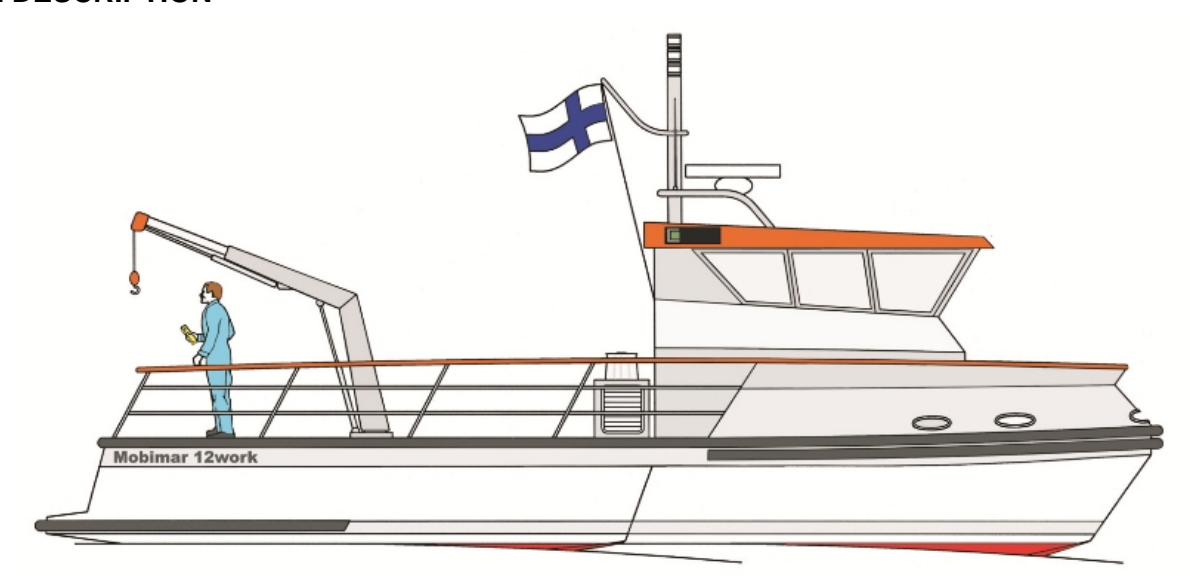
Mobimar 12 Work offers an exceptionally wide and stable working platform. The vessel hull form is a carefully optimised trimaran. Different load conditions have relatively little influence to speed. Fuel consumption is low allowing for smaller fuel tanks and better payload. Smaller operation costs.