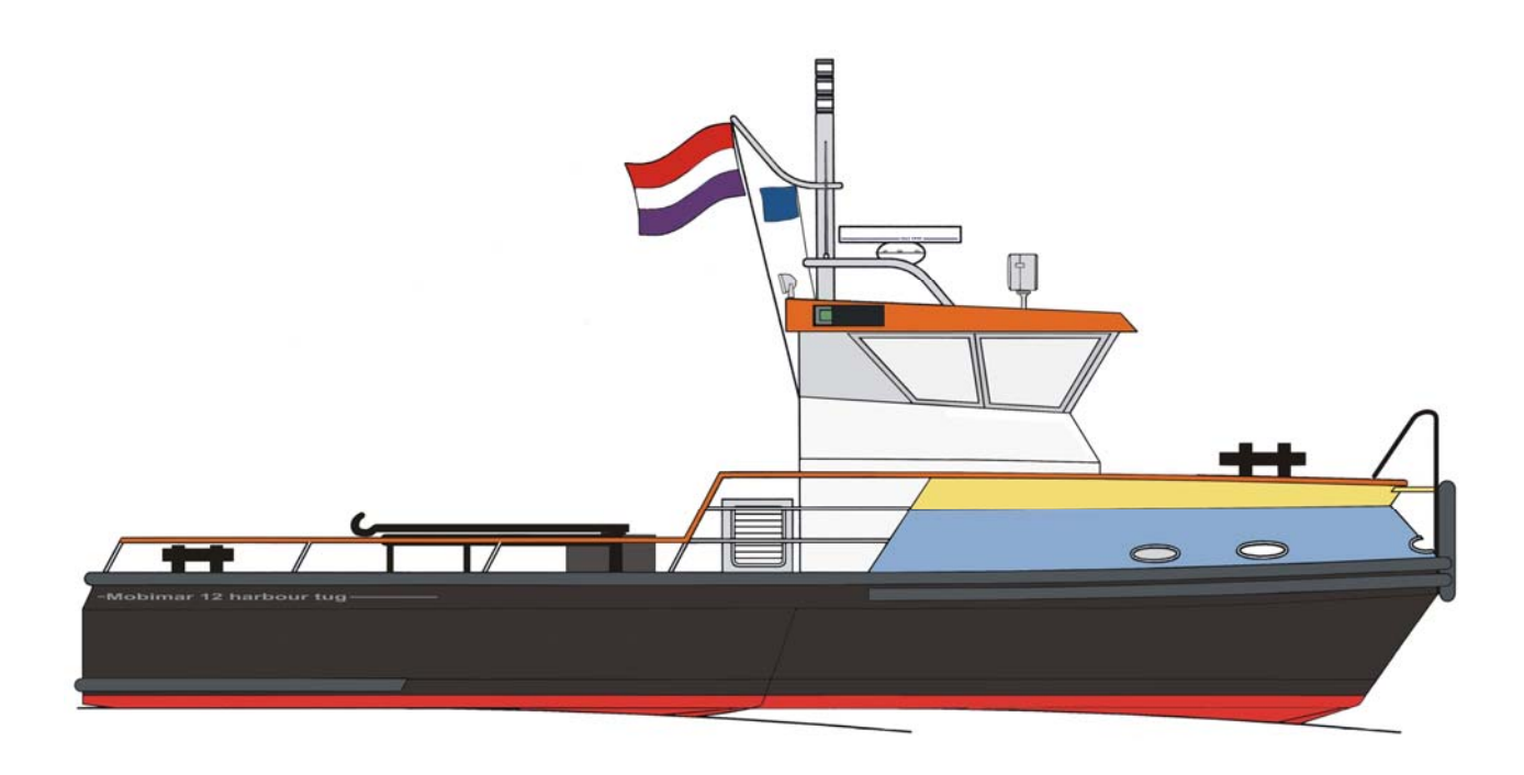
Outline Specification - Mobimar 12 Work Workboat, Tugboat, Oil Recovery Vessel

MOBIMAR LTD. STREET PANSIONTIE 56 VAT FI0944501-4 P.O. Box 86 ☎: +358-207 698500 email sales@mobimar.com FIN-20101 TURKU FAX: +358-207 698501 URL http://www.mobimar.com