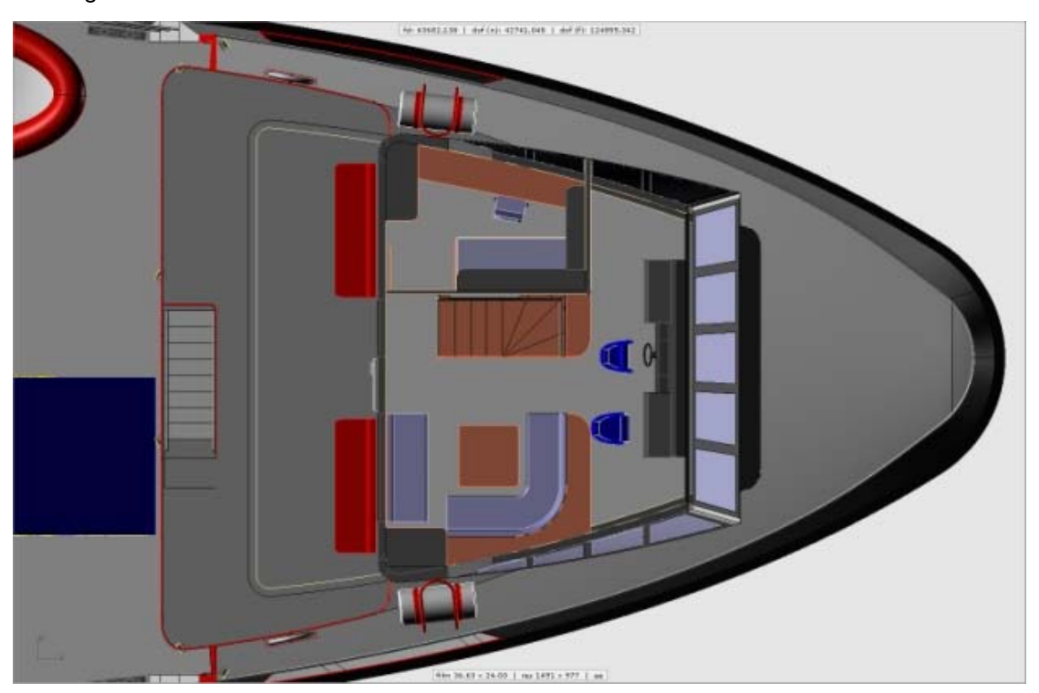
Bridge deck level: Navigation area, Captain's Cabin, Operation Centre

Mobimar 30 has accommodation arranged so that there are three cabins: One for the Captain on bridge level and two cabins on main deck level for the crew.